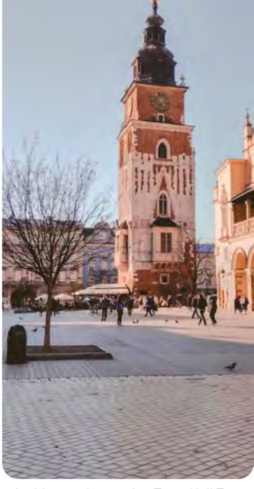
Architectual marvels - Town Hall Tower