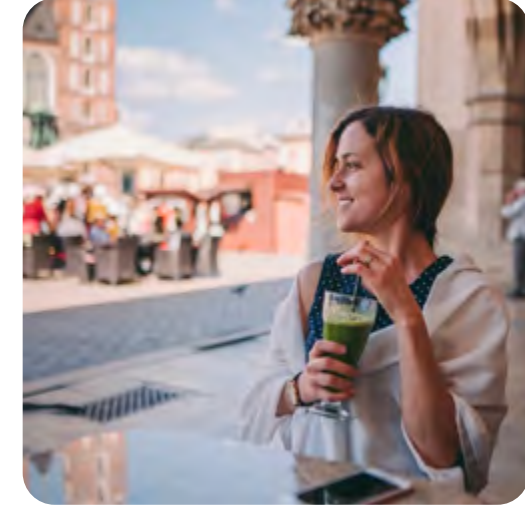
Cafe's near the Main Square